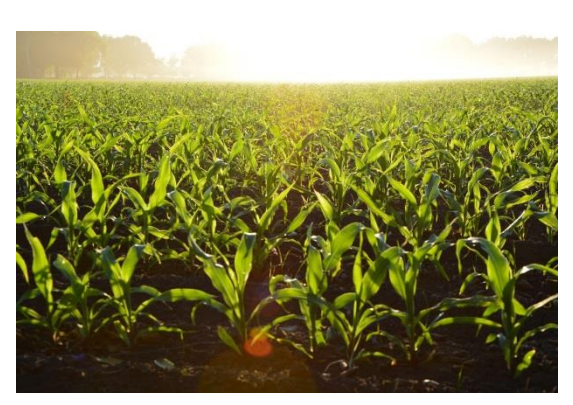
present-use value classification. This process will ensure that all present-use value properties are reviewed in an eight-year period. Since most counties were on an eight-year reappraisal cycle when the statute was written, the statutory language seems to anticipate that all the parcels will be reviewed during a county's eight-year reappraisal cycle. However, the statutes do not prevent more frequent reviews of properties. Some counties on more frequent reappraisal cycles have chosen to review all

The county assessor must annually review at least one-eighth of the properties in the present-use value program per G.S. 105-296(j), in order to verify that those properties continue to qualify for